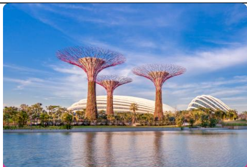
GARDENS BY THE BAY

Please present your Changi Flexi Pass at the ticketing counter before entry.