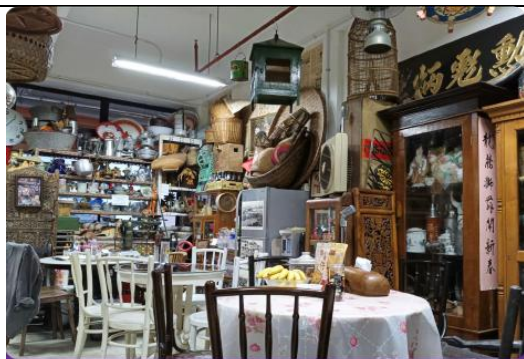
CHARLIE LIM HERITAGE MUSEUM