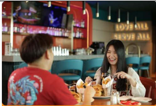
HARD ROCK CAFE SET MEAL

Fuel up before your flight with Hard Rock Cafe's legendary set meals, available exclusively at Changi Airport Terminal 2.