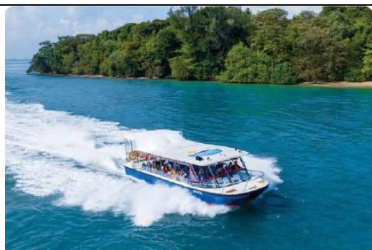
ALBATROSS SPEEDBOAT ADVENTURES