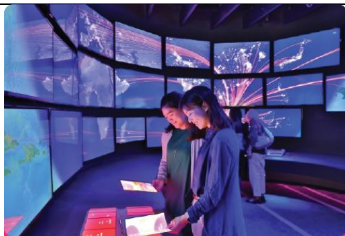
CHANGI EXPERIENCE STUDIO